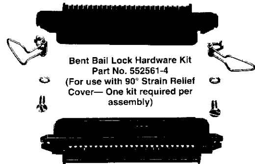
Bent Bail Lock Hardware Kit Part No. 552561-4 (For use with 90° Strain Relief Cover— One kit required per assembly)